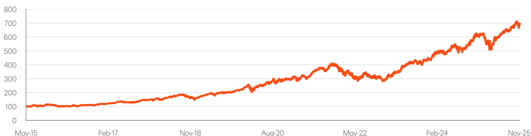
Value of $100 invested since inception

Past performance is not indicative of future performance.